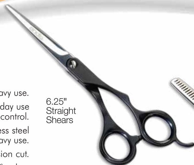
6.25" Straight Shears