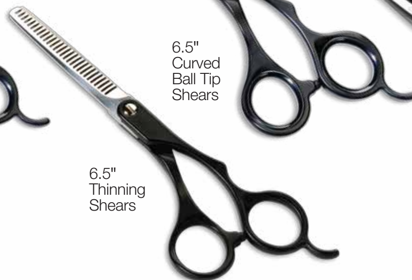
6.5" Thinning Shears