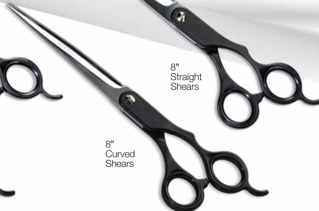
8" Curved Shears